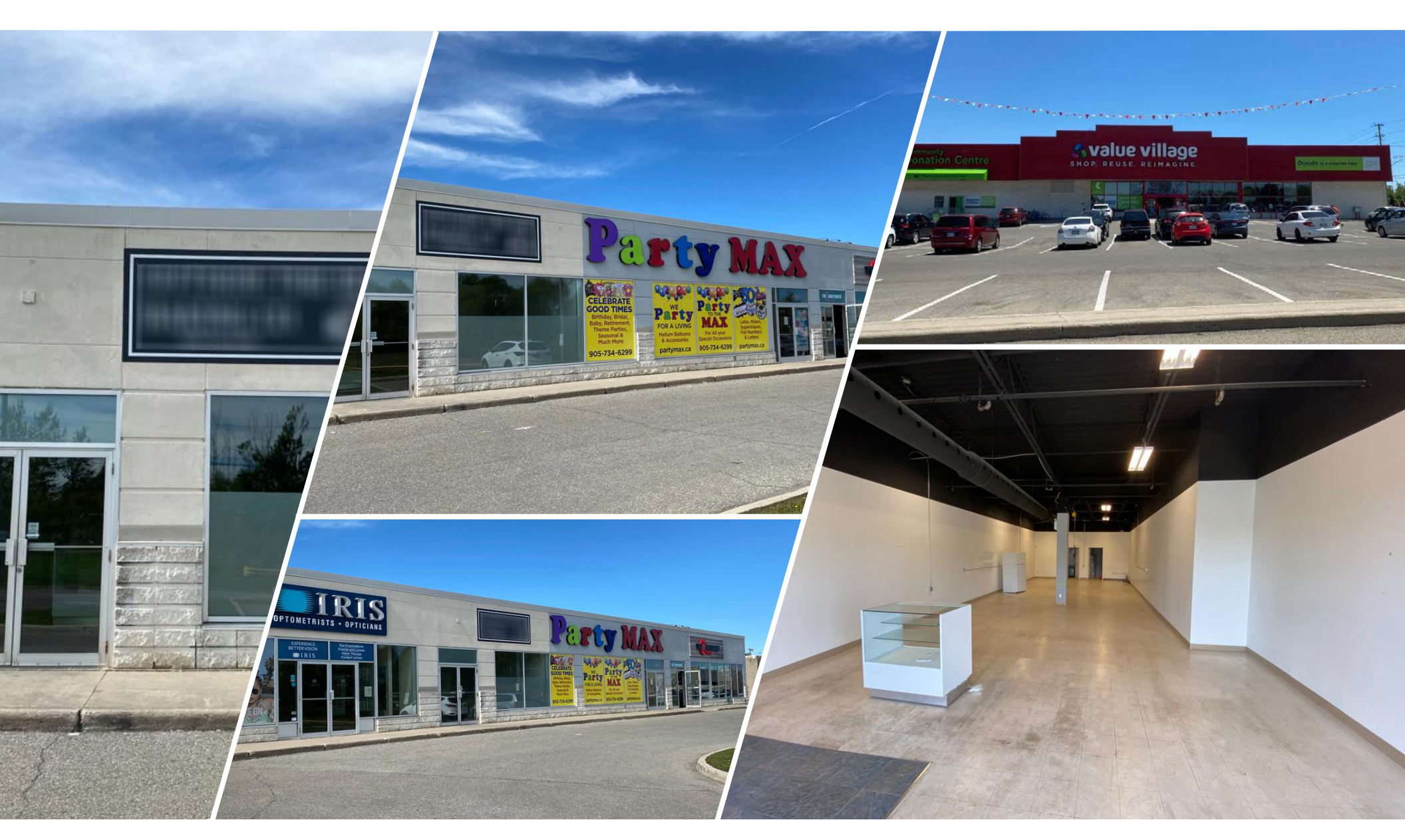
CLOCKWISE FROM TOP LEFT: Unit 5 // Unit 5 // Value Village // Unit 5 // Unit 5 Interior