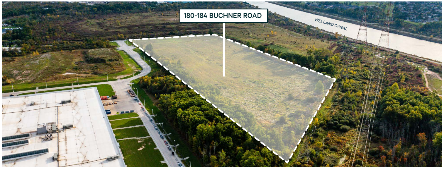
*All Outlines Are Approximate