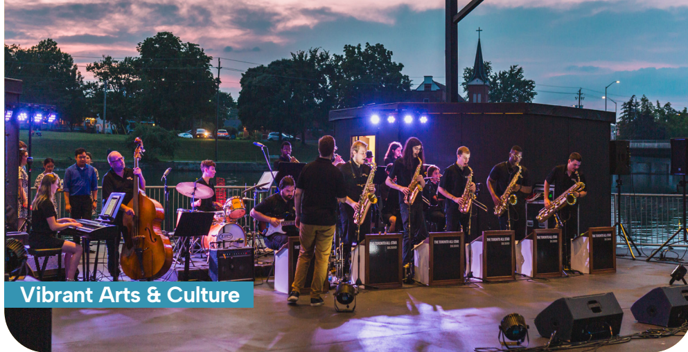
Vibrant Arts & Culture