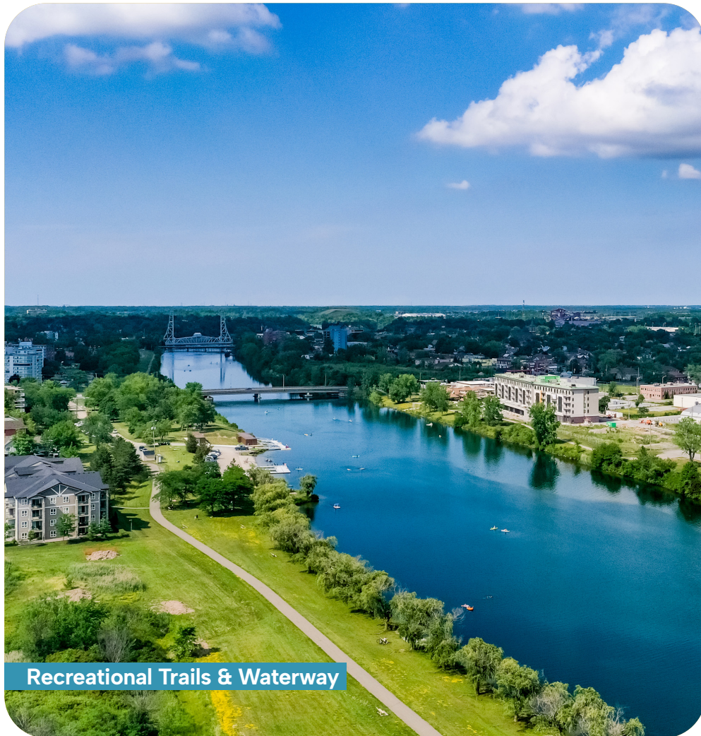
Recreational Trails & Waterway

Welland is committed to your success — we're ready when you are.