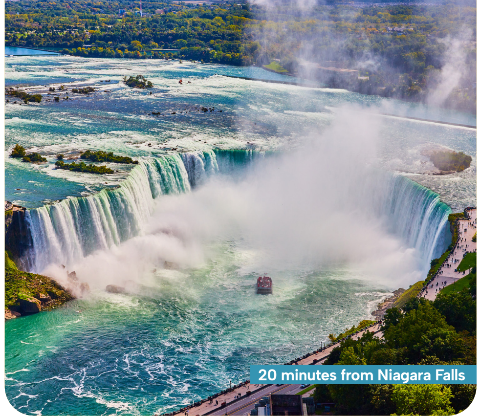
20 minutes from Niagara Falls